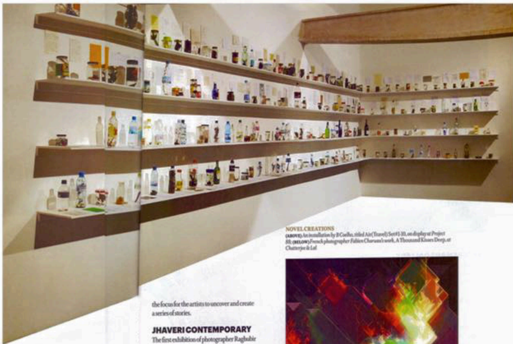
NOVEL CREATIONS (ABOVE) An installation by B Coelho, titled Between Here and There , on display at Project 88; (BELOW) French photographer Fabien Charvau's work, A Thousand Kisses Deep , at Chatterjee & Lal

In this exhibition, curator Shanay Jhaveri attempts to not only emphasise Singh's formal achievements as a photographer but also draws attention to the historical significance of these images, as well as Singh's contribution of capturing the transforming landscape of post-independence India. The exhibition also showcases works by Ram Rahman, Sooni Taraporevala and Ketaki Sheth, a generation of photographers mentored by Raghbir Singh.