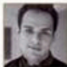
ASHISH SHAH DESIGN

Art galleries across the country have started the season on a high note with a series of exciting shows offering an eclectic mix of works