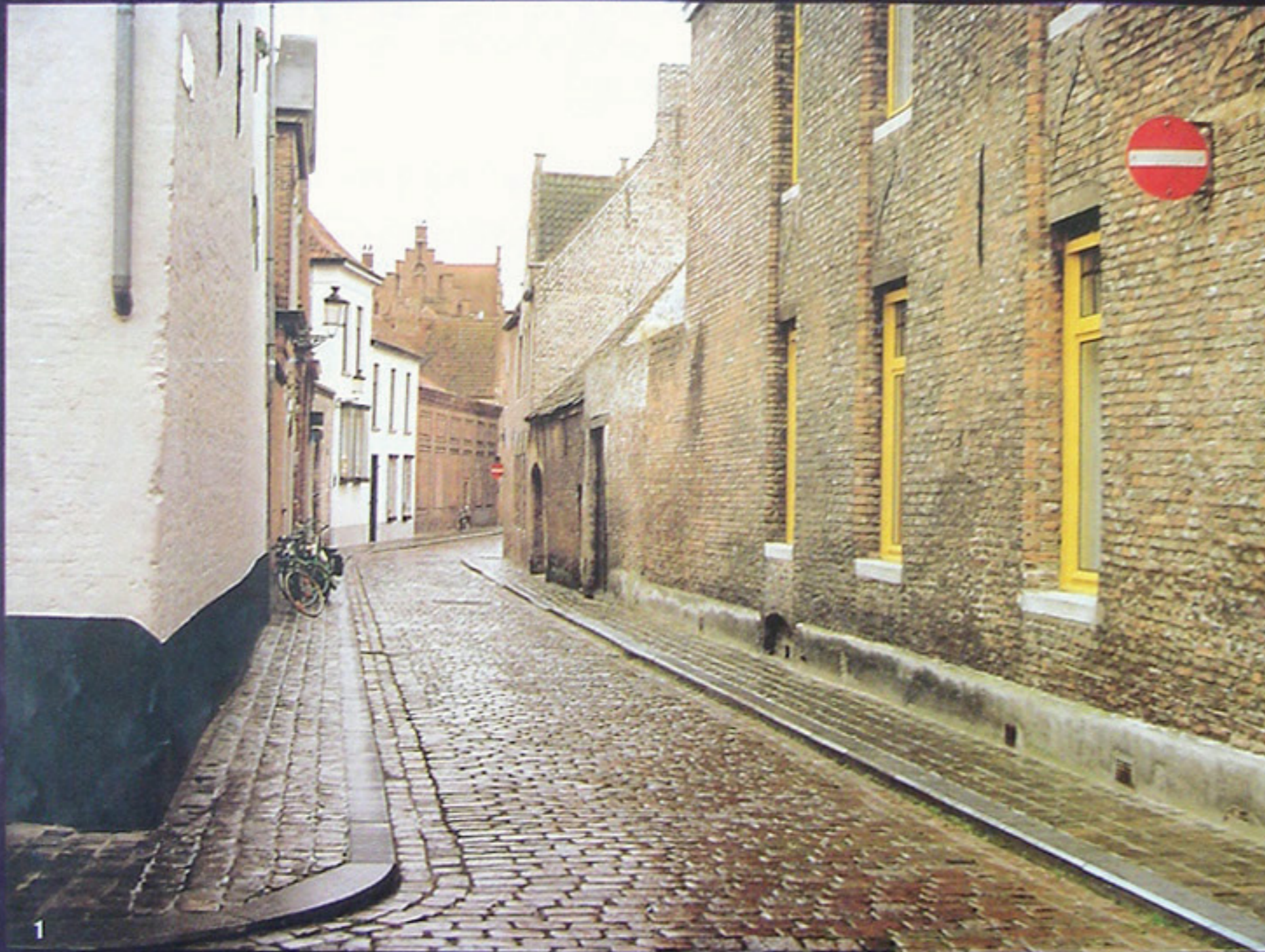
1. Empty Alley Technical Details: Camera: Nikon FG-20 Film: Kodak Exposure: Not Known